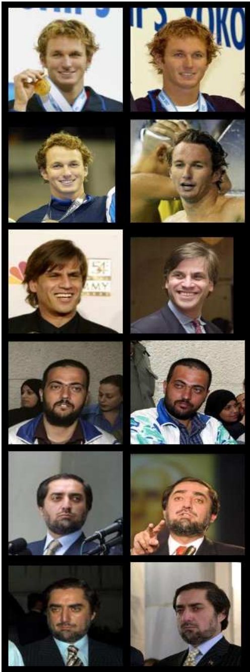
Fig. 1. Matched pairs. These are the first six matching pairs in the database under View 1, as specified in the file pairsDevTrain.txt . These pairs show a number of properties of the database. A person may appear in more than one training pair (first two rows). An image may have been cropped to center the face (3rd row, right image) according to the Viola-Jones detector, but the image has been padded with zeros to make it the same size as other images.

Viola-Jones face detector [35], but have been rescaled and cropped to a fixed size (see Section VI for details). After running the Viola-Jones detector on a large database of images, false positive face detections were manually eliminated, along with images for whom the name of the individual could not be identified.